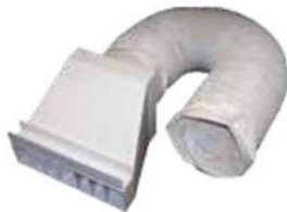
THCP-DD and THCP-WD12