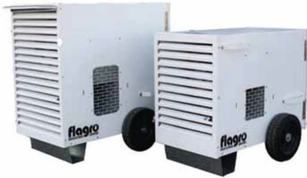
THC-175 & THC-85