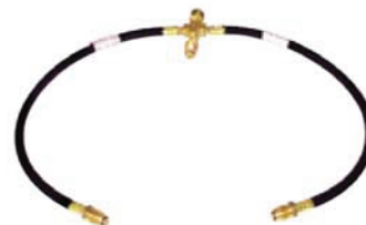
2001-S3 3 cylinder manifold